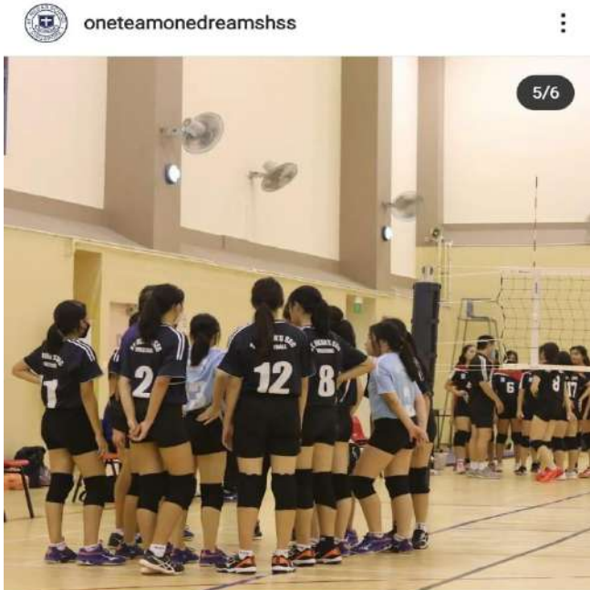
Liked by juncats and 369 others oneteamonedreamshss Volleyball Girls • Victory! Our Volleyball Girls secured a hard earned victory over their... more April 1