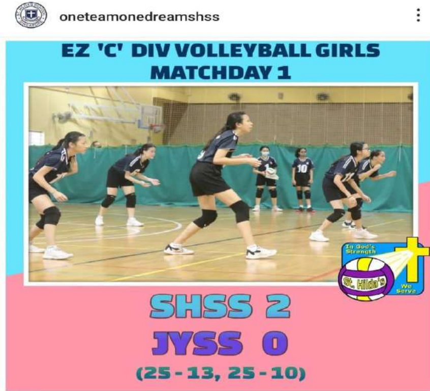
Liked by _mydelicatepastel and 293 others oneteamonedreamshss Volleyball Girls • Our Volleyball Girls started their C Div campaign with a victory over Junyua... more