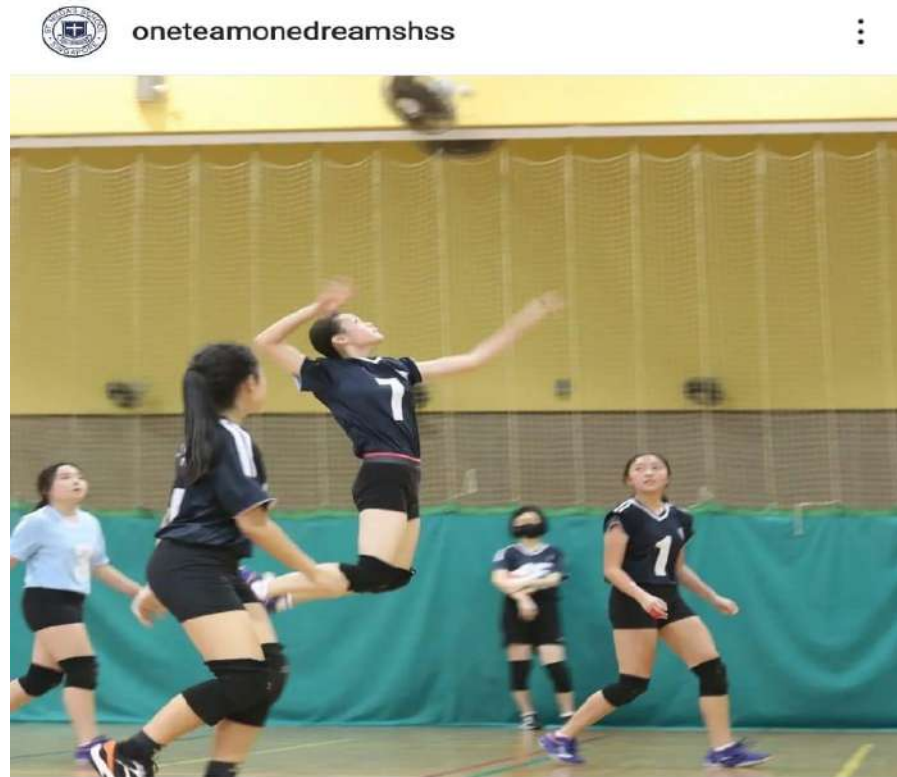
Liked by beloved_von and 503 others oneteamonedreamshss Volleyball Girls • Winner! Our Volleyball Girls secured their first win for this year!... more View all 2 comments March 28