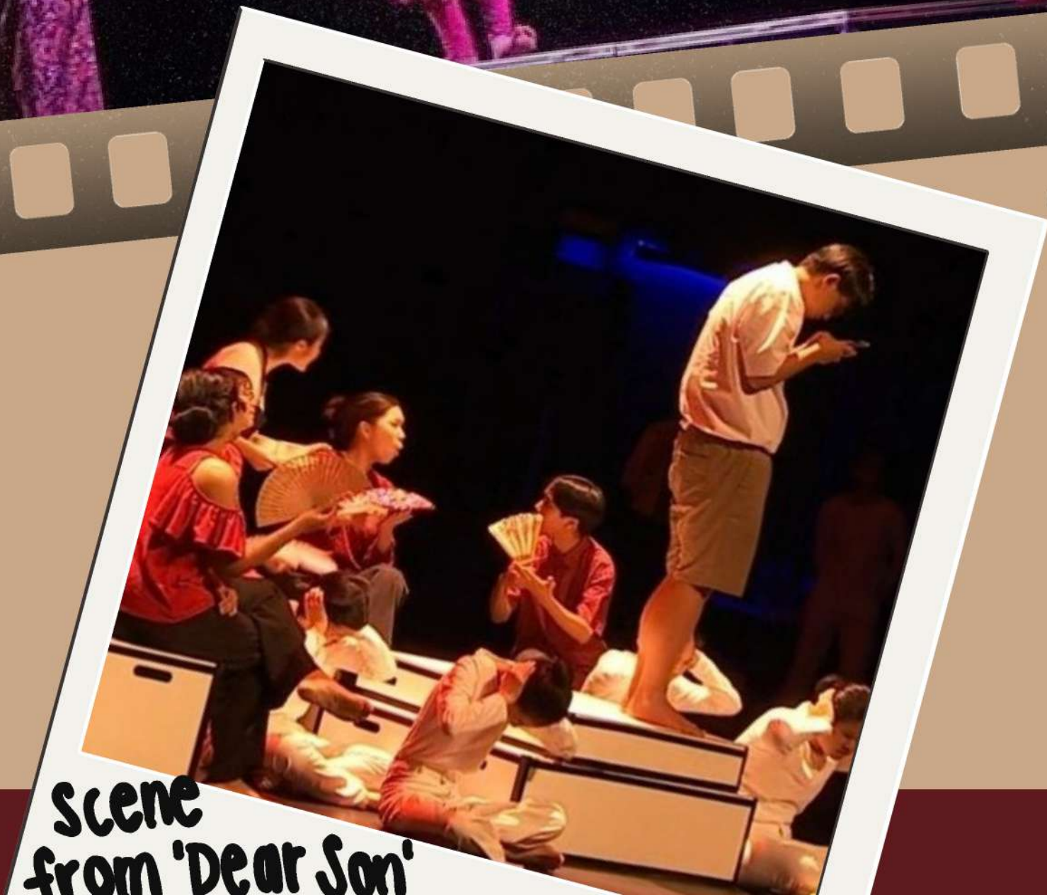
Scene from 'Dear Son'